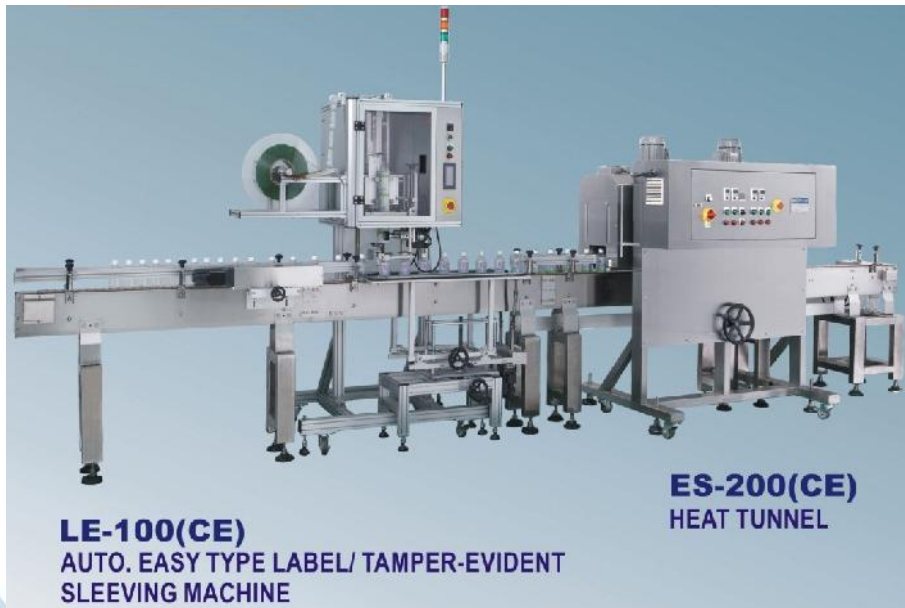
LE-100(CE) AUTO. EASY TYPE LABEL/ TAMPER-EVIDENT SLEEVING MACHINE